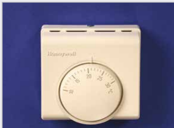
Standard remote on/off and speed change thermostats,

DN20 (3/4" BSP) isolating ball valves complete with ground faced unions or gate valves can be fitted external to the casework, directly to the flow and return connections of the heating coil.