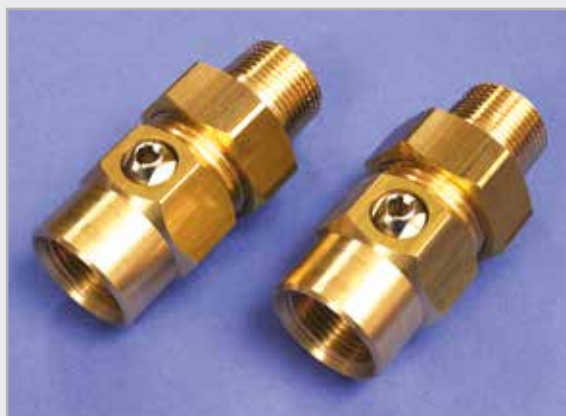
Fitted isolating valves