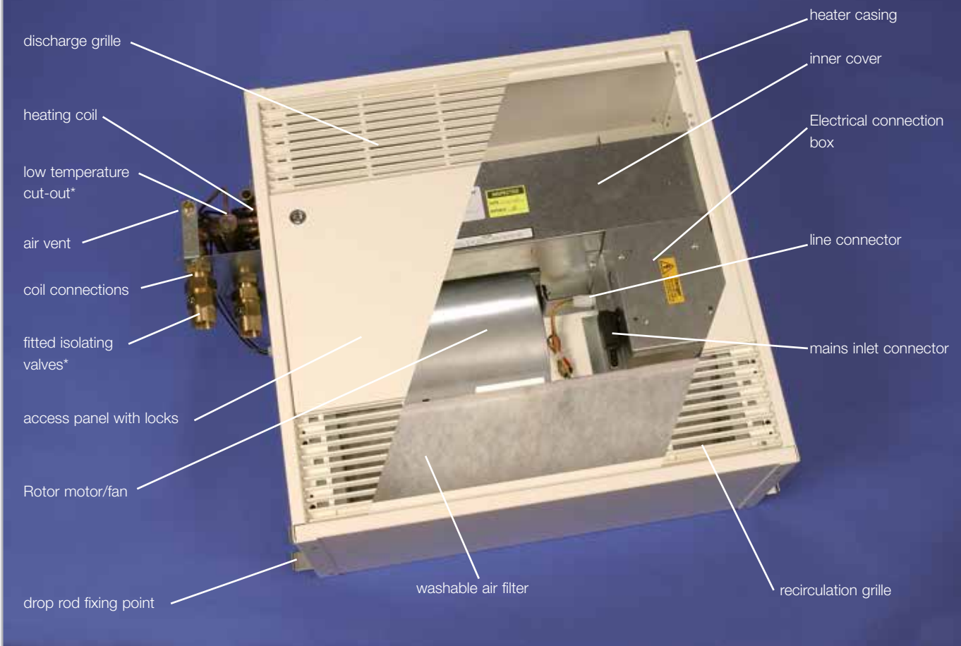
Model 600 - 6 (left hand connections, right hand opposite)