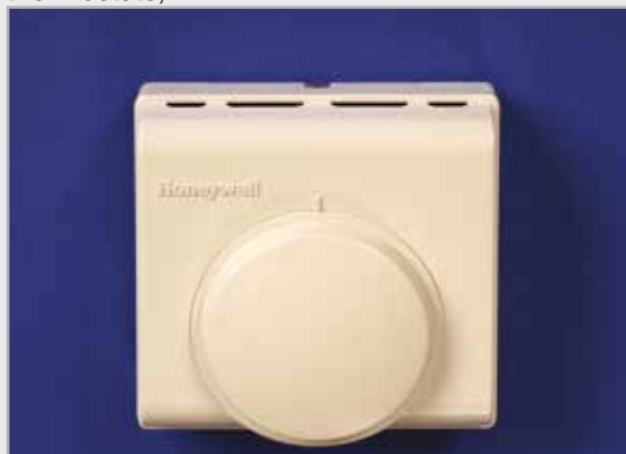
Tamperproof remote on/off and speed change thermostats,