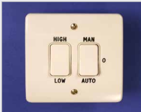
Remote high/low and manual/off/auto switches.